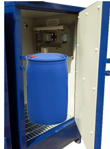
Typical Drum External Decant Station