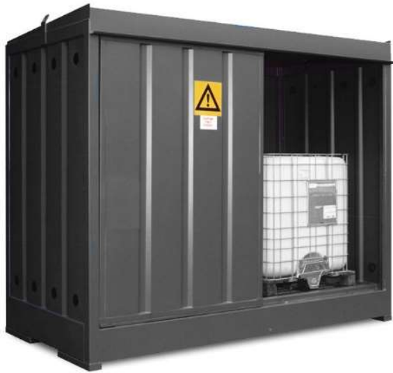
Typical IBC External Decant Station

Suncombe External versions of Process Chemical Decanting Systems provide weatherproof containers or enclosures, which are weatherproofed and include connection, transfer, pumping, control, heating, lightning, self-bunding and other safety and operational features.