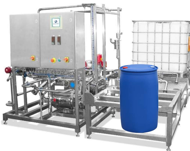
Typical IBC and Drum Internal Decant Station

Suncombe Internal versions of Process Chemical Decanting Systems are designed for decanting from chemical containers within a building and include connection, transfer, pumping, control, self-bunding and other safety and operational features.