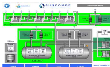
Typical Operator Interface