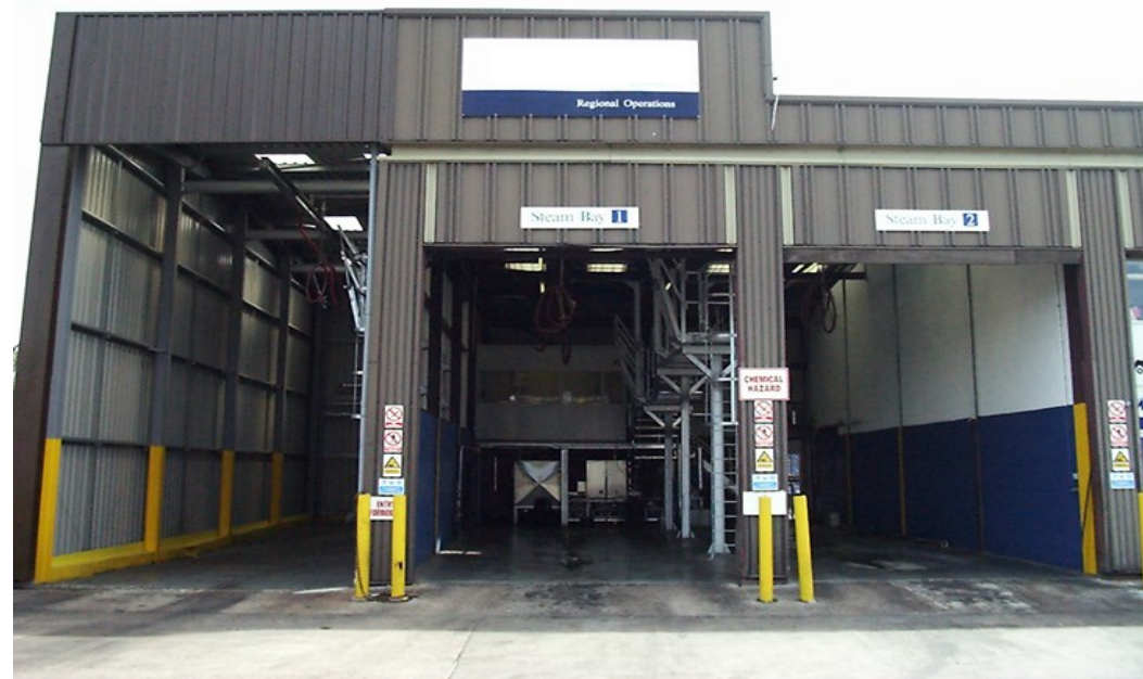
Typical Tanker CIP